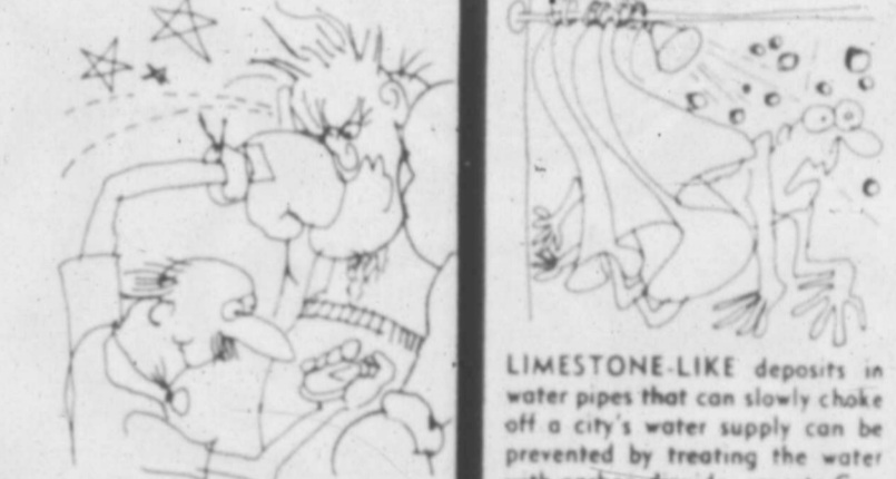
A UNIVERSITY of Cincinnati psychologist is probing the secrets of the eyeblink to see how fast people respond to stimuli and to discover how much more people blink when they anticipate that something is going to happen.