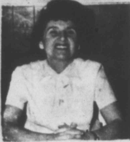
By HAZEL HOUSE

Scripture: St. Luke 16: 23; Hebrew 11: 1, 2; Romans 10: 8-13.