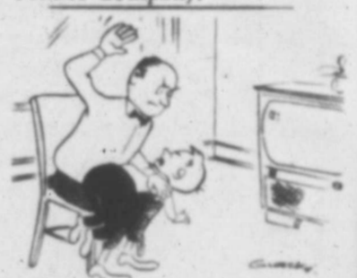
"Wait 'til my analyst hears about this!"

as a junior geologist with the Texaco Company.