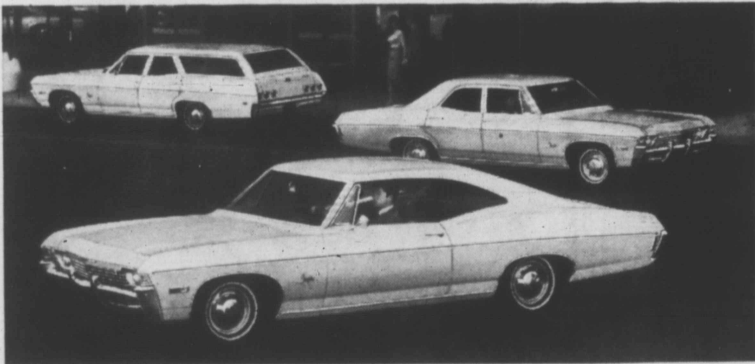
Impala Sport Coupe (foreground), 4-Door Sedan, Station Wagon

The winsome lass above, representing her nearly 73,000 'sister FHA'ers in Texas, is appearing on billboards all across the State in observance of National FHA Week, March 31 through April 6, 1968. This salute to the contribution made by these young people to their homes and communities is sponsored by the Future Homemakers of America, Texas Association, and rural electric cooperatives. The Outdoor Companies of the State are donating the sign space for the showing.