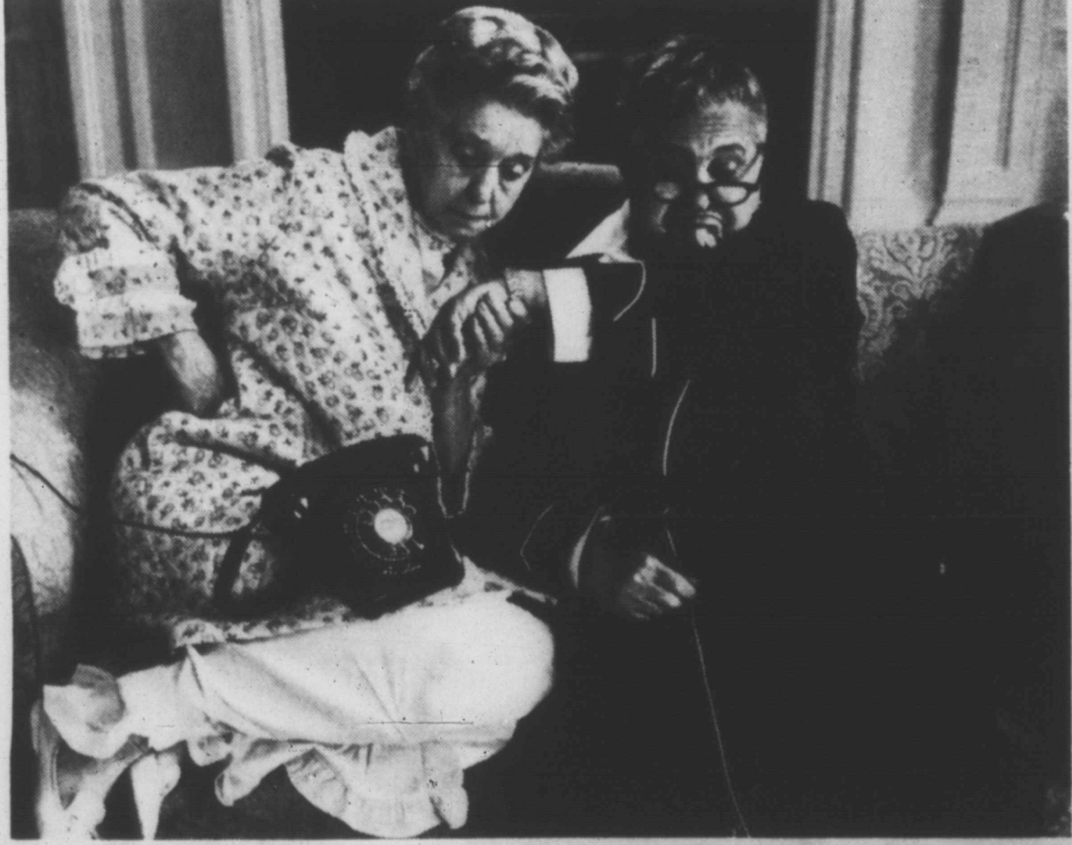
After 7 p.m., you can call anywhere in the country for a dollar.

All long distance callers worth their salt know that calling in the daytime is more expensive than calling in the evening hours. (Actually, most people call during the day, when we charge our regular rates.)