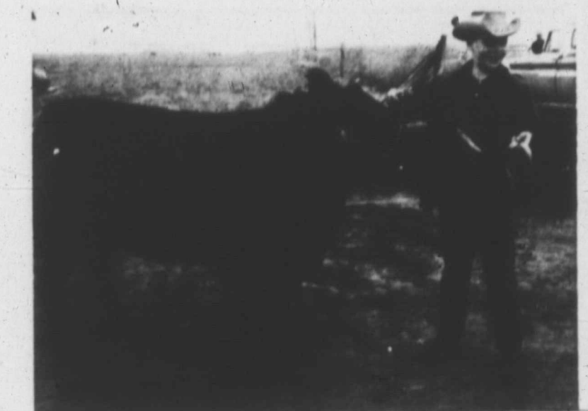
Reserve Champion - Jimmy Fields with his Reserve Champion Angus calf.