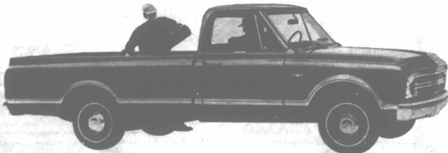
America's best selling 6-cylinder pickup—Chevrolet's Model CS 1084 Fleetside

A Chevy pickup gives you more truck for the money