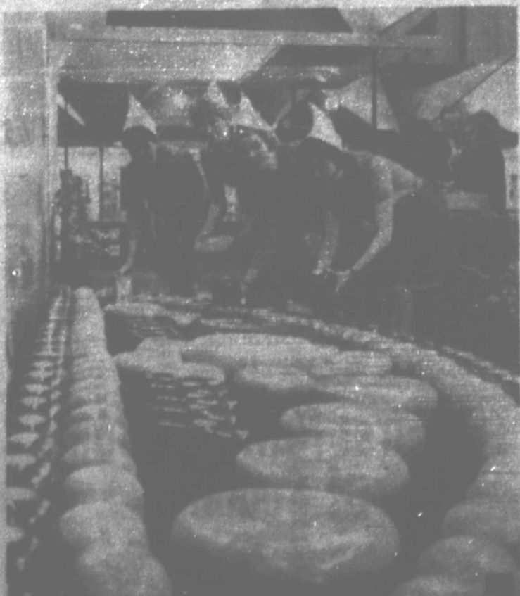
PUSH PRODUCT — A boy of girls are positioned with variety of choices at the Netherlands exhibit at annual "Green Week" horticultural show in West Berlin.