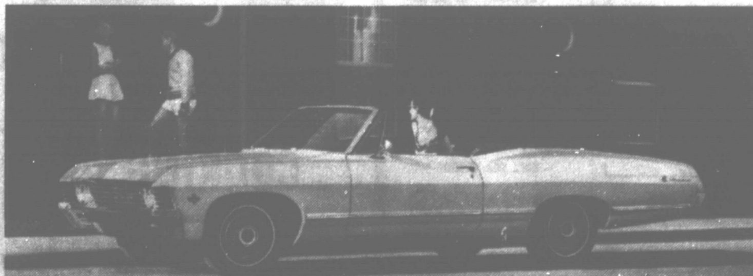
Impala Convertible—with most everything higher priced cars give you

(And that low price brings you a road-sure ride, Body by Fisher quality, and a traditionally higher resale value. You also get wider front and rear tread for greater stability and handling, foam-cushioned seats, and extra fenders inside the regular ones to help inhibit rust. Most everything more expensive cars give you!)