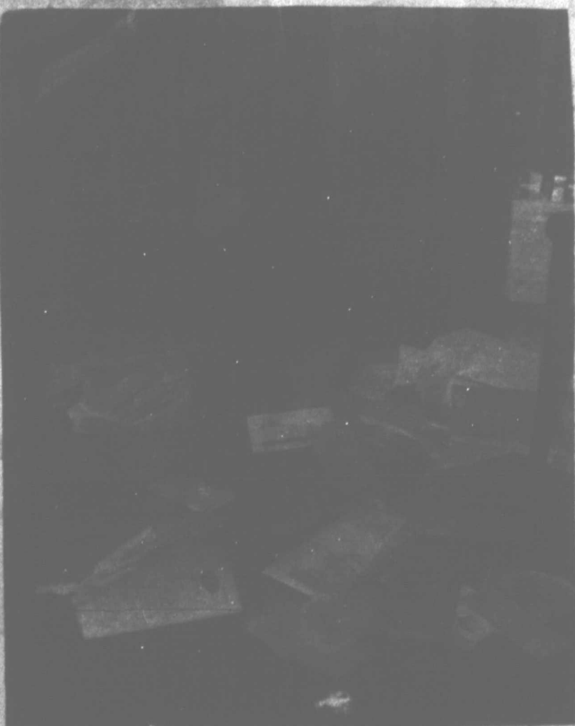
WHERE IS IT? - Thieves literally tore the office apart at White's Auto in their search for valuables.