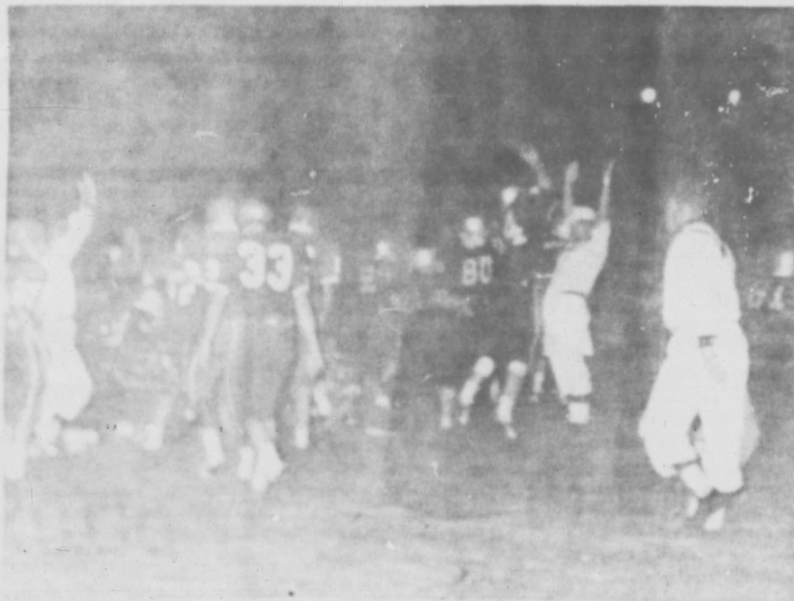
TOUCHDOWN !!! - Shown above is an action shot taken during the Sudan-Sundown game. Shown on the bottom of the pile is Mike Bellar who went over from the 4-yard line to cap a 65 yd. drive in the third quarter.