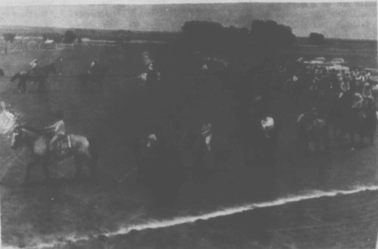
GRAND ENTRY—Shown above is a portion of the Grand Entry at the Little Britches Rodeo held here Sunday afternoon.