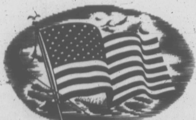
CITIZENS: FLY YOUR FLAG SATURDAY, FEB. 12, 1966