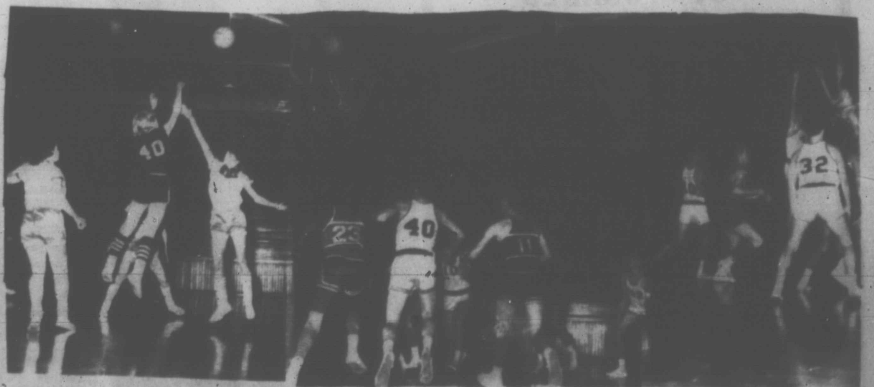
ACTION SHOTS TAKEN DURING THE SUDAN-HALE CENTER GAME TUESDAY NIGHT