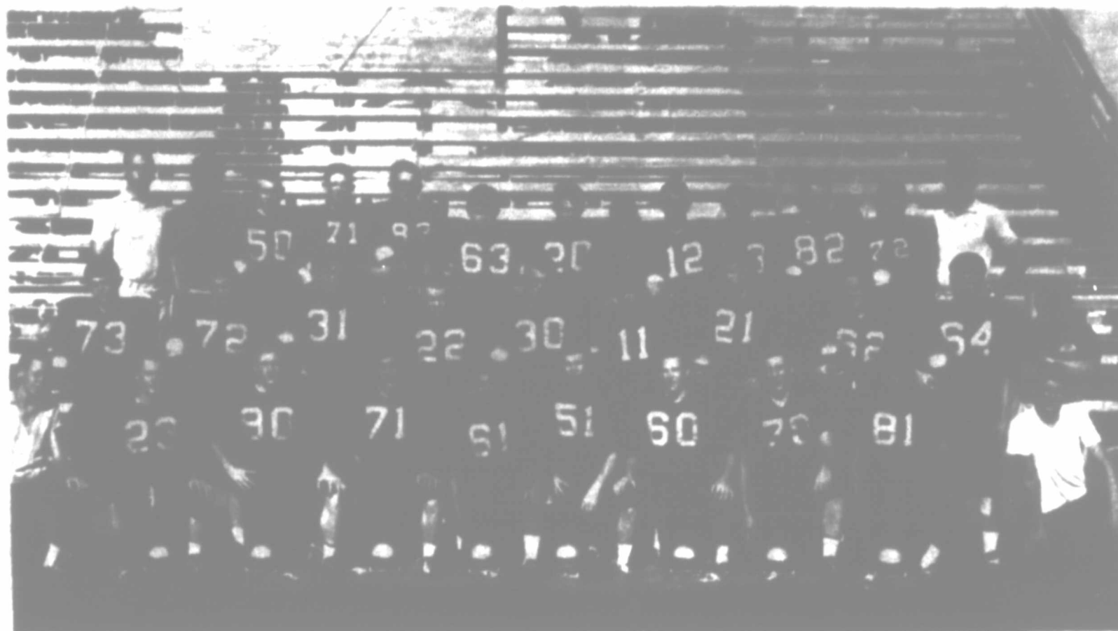
SUDAN HORNET FOOTBALL SQUAD FOR 1965

* Denotes Conference Games Conference Games start at 7:30 All Others Start at 8 p. m.