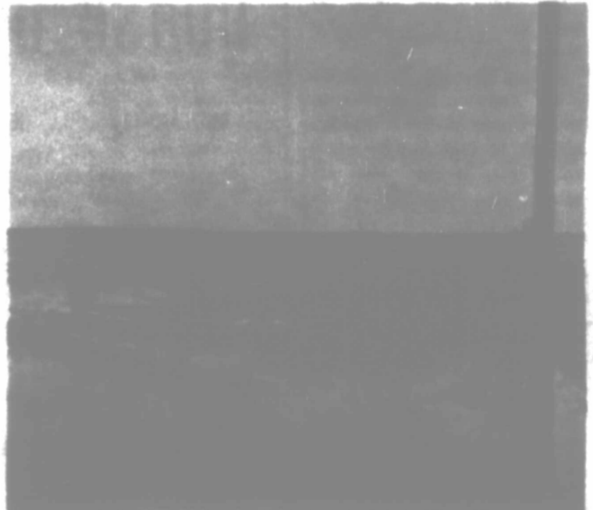
ANYONE FOR SWIMMING - The picture shows one of many farms that were under water after the recent rains in this area.

One farmer reported that the rain we received was the largest rain that he had seen in this area that fell in such a short period of time.