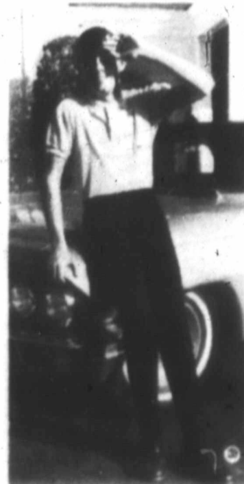
TRIM —All cotton twill pants, tailored in the continental tradition, have built-in stretch. They "give" in action and return to their original trim fit as soon as tension goes. Sanforized-Plus for superior wash and wear. They come in black or sand colors.