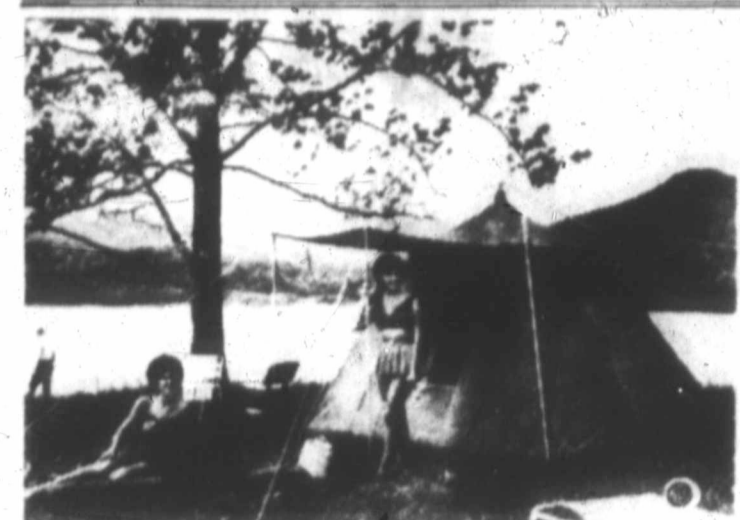
CAMPERS' FAVORITE—Most popular type tent for touring vacations is the umbrella style in durable cotton canvas. It requires only a small amount of ground room and is easy to erect. By Camel Manufacturing Company.