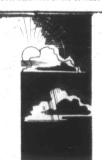
WORDS that COMPORT

If you are a parent (and we have just passed a Sunday when we honored our "dade" )you are at least somewhat aware of what