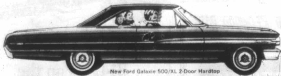
New Ford Galaxie 500/XL 2-Door Hardtop

It's switch, swap & save time at your Texas Ford Dealer's