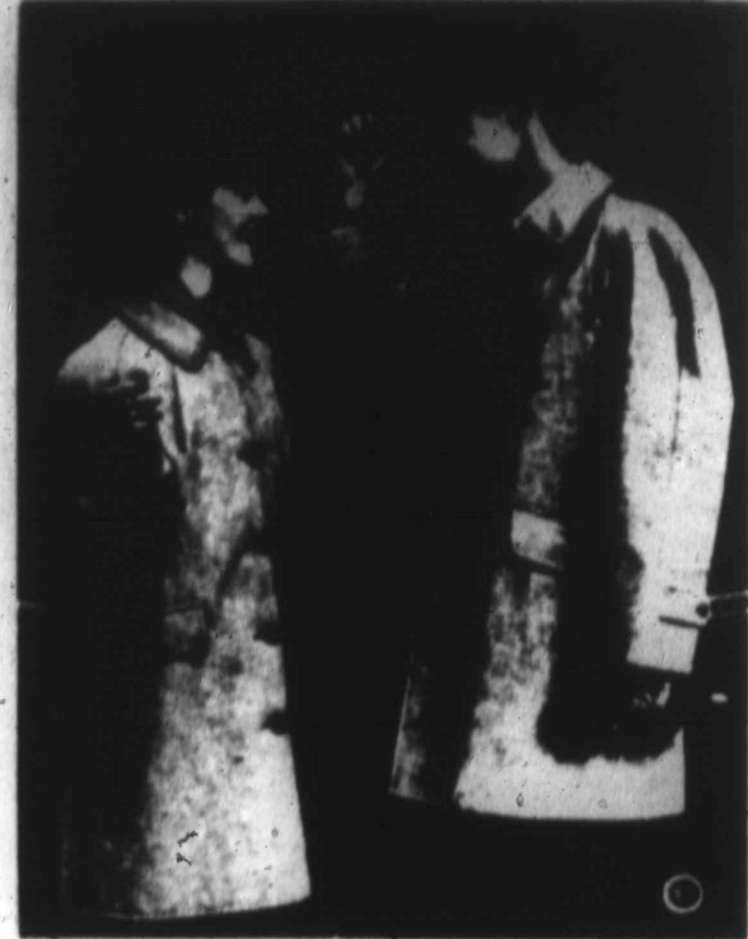
HIS AND HER RAINWEAR—All-weather car coats of sturdy cotton denim take on new comfort for winter wear. In look-alike styles for men and women, these coats are laminated with Scott Apparel Foam to provide insulation in all temperatures and to keep their crisp good looks.