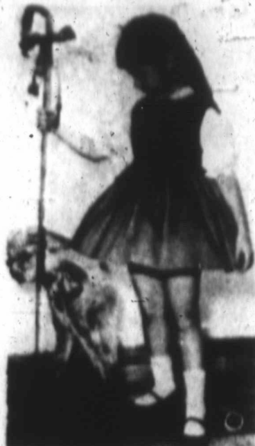
PARTY-TIME—And the young miss chooses a Bevarian-inspired outfit with a black velvet jacket, dainty tuckered bodice, and bright red bouffant skirt. By Cinderella.