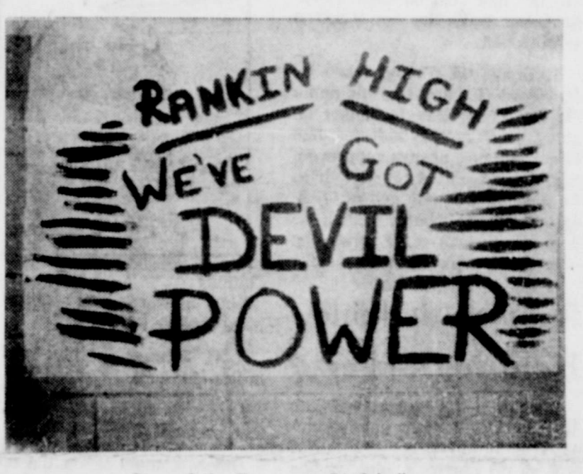
Sign of the Times-in RHS hallway