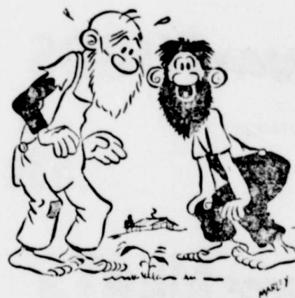
RECKON GRANPAW' SHOULDA INSURED HIS CROPS WITH...