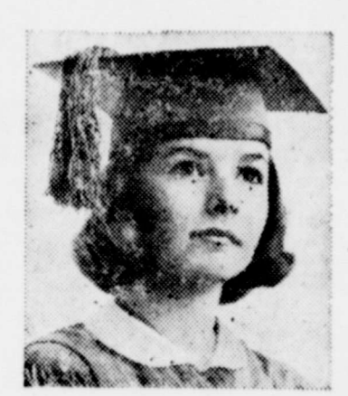
HIS and HERS

Graduation Gifts for All . . . Rankin student sizes on file . . . makes for easy selections at . . .