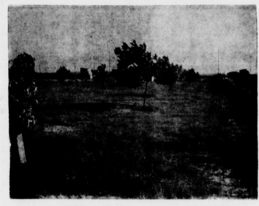
Drip irrigation system is credited with much of the growth recorded in this six-yard old pecan orchard, the same one pictured on Page 1.