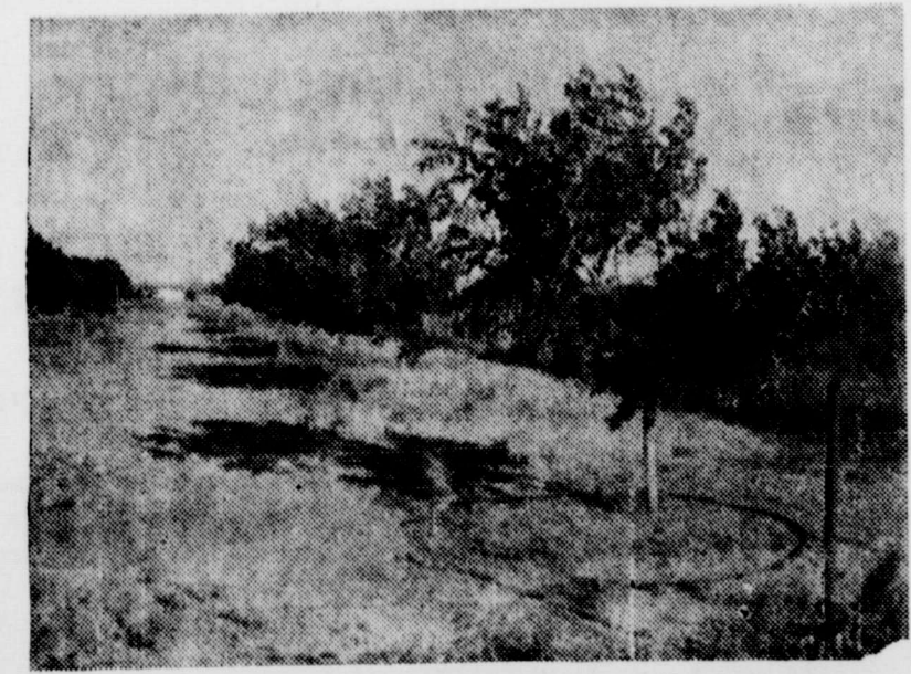
Pecan trees belonging to S. O. Langford and planted in 1968 show healthy growth in short time. For a view of trees, taken in 1970, see Page 7.