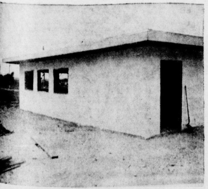
Work almost finished