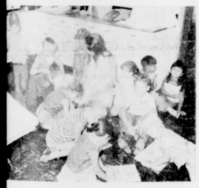
Turning the Crank