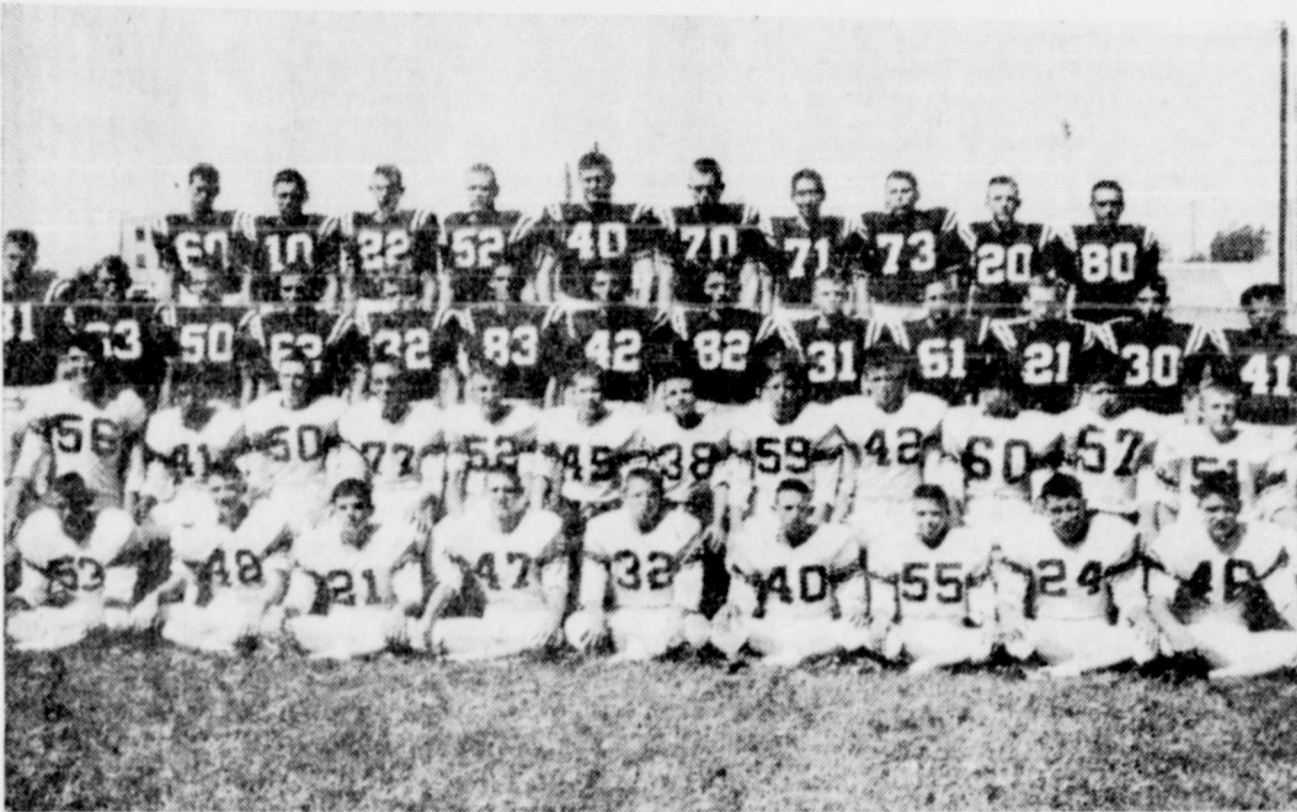
The Rankin Red Devils of the Year ????