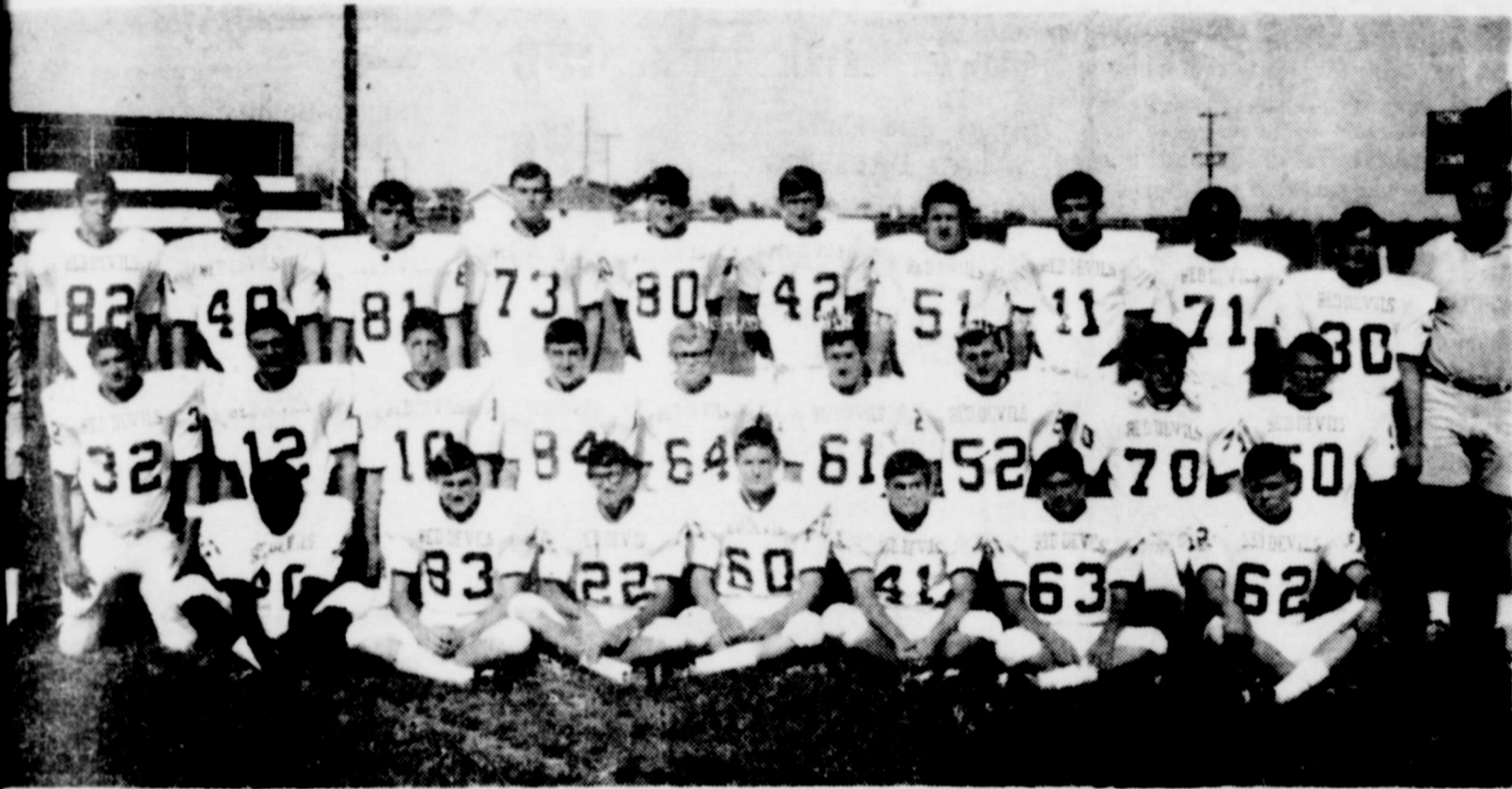
1971 RANKIN RED DEVILS