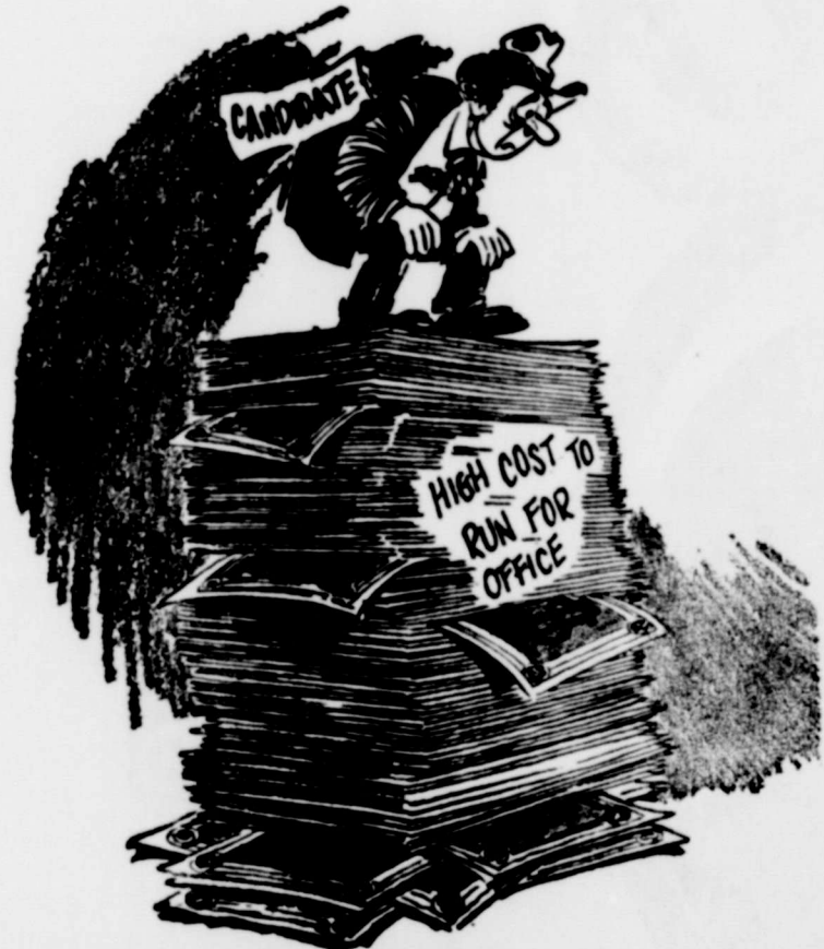
IT'S A STACKED DECK