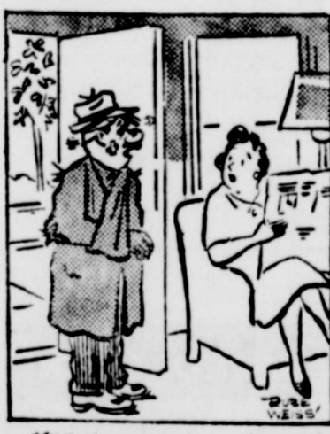
"While crossing the traffic light was green, halfway it turned red."

The dog bounded to her, stopping just when they were nose to nose. She gazed up at him a moment with a puzzled expression, then breathed, "Hi, horsey!"