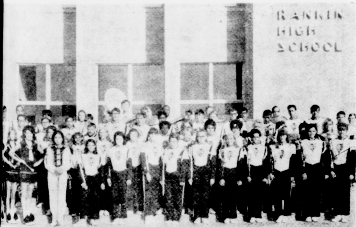
69 Red Devil High School Marching Band

on this Page this week Salute the RHS BAND