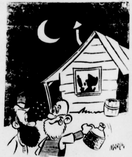
AM AIN'T SKEERED O'MAW...IM INSURED WITH