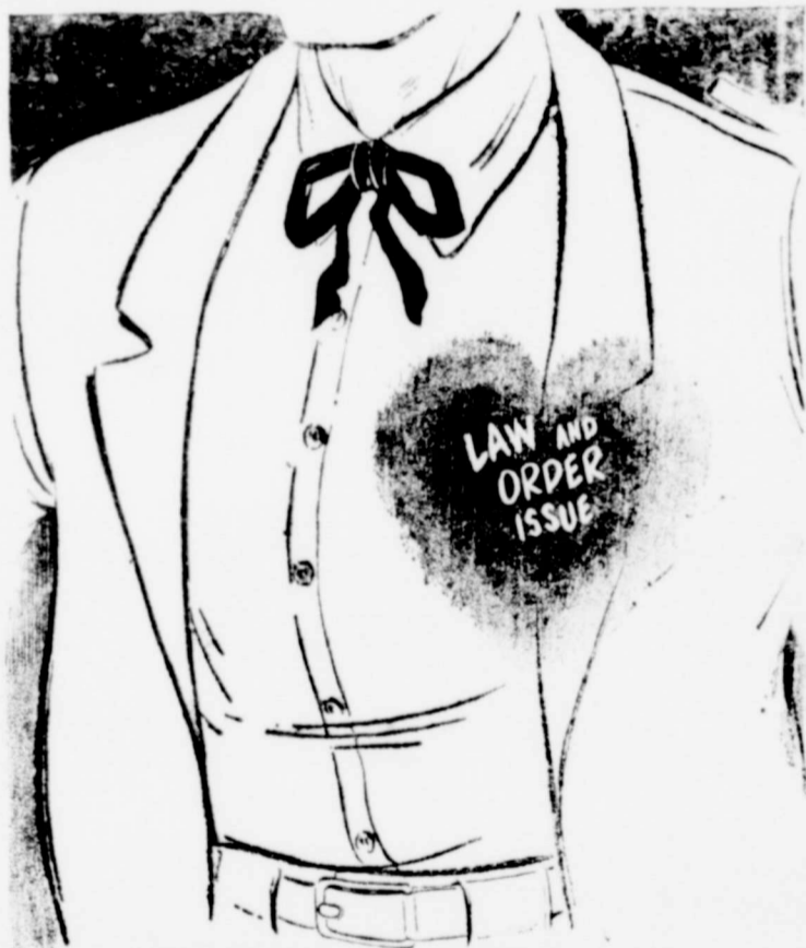
DEEP IN THE HEART OF TEXANS

—USED— Electric ADDING MACHINE $75 RANKIN NEWS