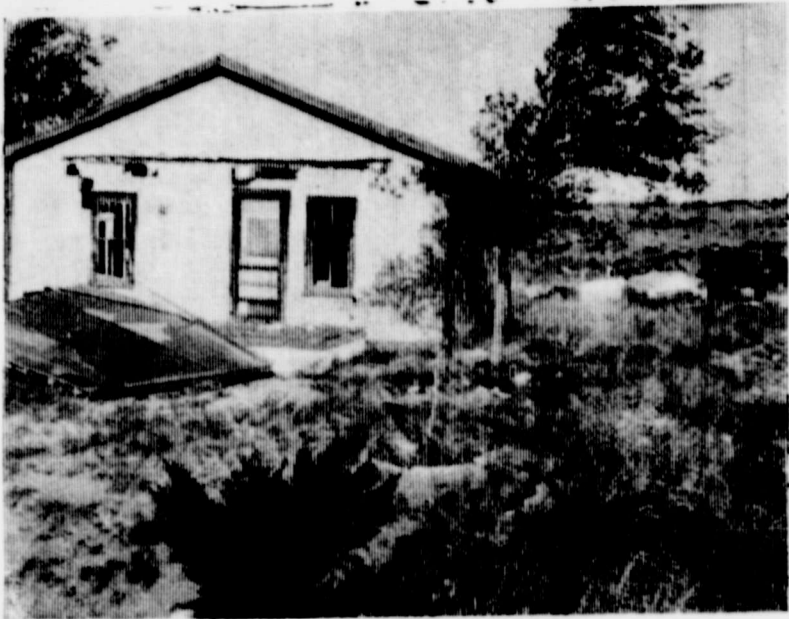
THIS RANKIN property represents a little of everything currently faced by Rankin City Council in their clean-up efforts—a deserted building, with fallen porch, half-dead trees, brush and abandoned car bodies—not unusual—just typical of many in all parts of town.