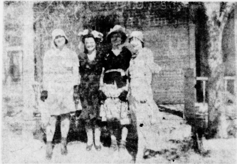
PROVING THAT the Hippie Movement actually started right here in Rankin is this picture taken in 1948 of four of our very own flower children. If you can't figure them out, turn to the back page under "Hippies."

Here -- auto insurance rates it won't be long the policy and they the car.