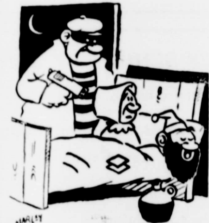
GO TO SLEEP, WE IS FULLY PERFECTED BY OUR BURGLARY INSURANCE WITH

Plans of operation for the new swimming pool will also be taken up at this time.