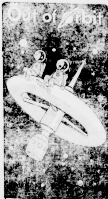
NICE VIEW UP HERE!