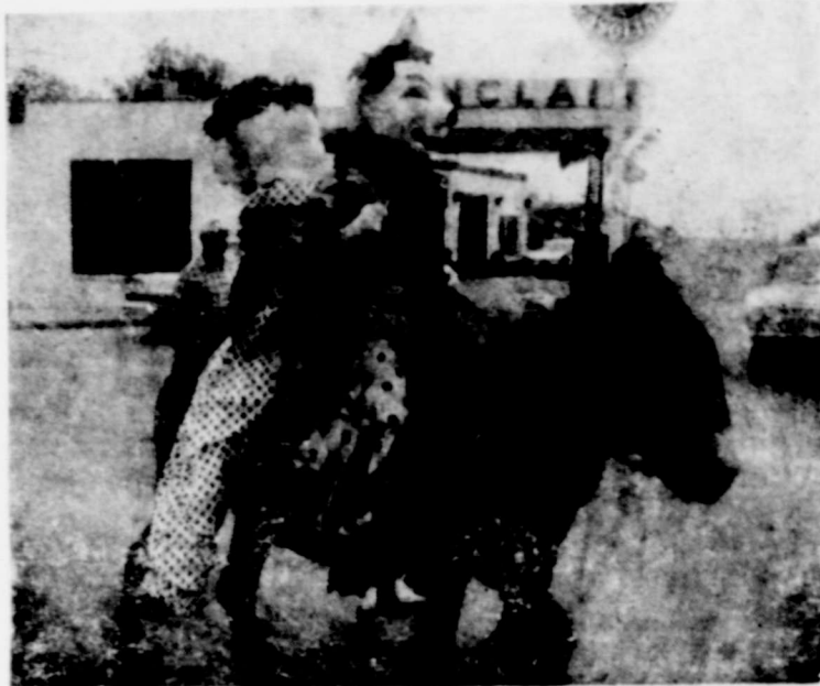
THE PARADE has always been a highlight of the All-Kid Rodeo and Friday's promises to be the biggest ever. Above, two cowboys (?) do a bit of fancy riding on a fast steed in a past parade.

And the end is not in sight. Youth rodeos are becoming more popular each year and with twenty years experience, the Upton 4-H Club is looking forward to another twenty year's growth.