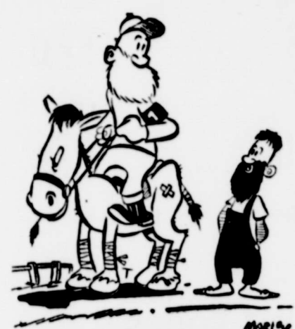
BEFORE TH' RACE GRANPA WE'RE HAVIN' YOU BOTH INSURED WITH