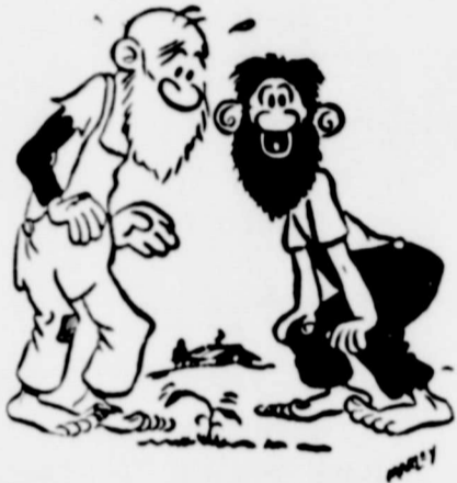
RECKON GRANPAW 'SHOULD' INSURED HIS CROPS WITH —