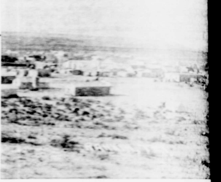
Despite the boosters' claims, not everyone lived in a nice home — even in East Ran-

It could be that I turning was pulling as back there in 1971