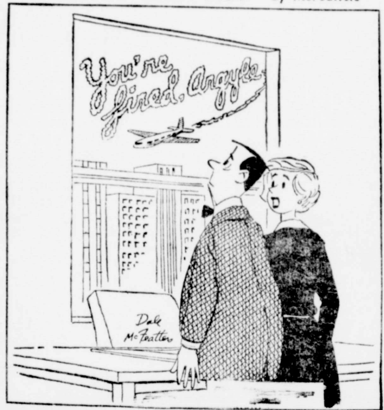
"You're right, Mr. Argyle, it IS the headquarters executive plane."

Published weekly at 918 Grand Street, Rankin, Texas 79778, Ph. 693.2873, Drawer 445.