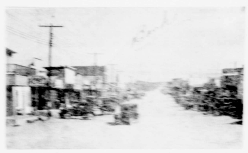
"Business was good and perfing better"