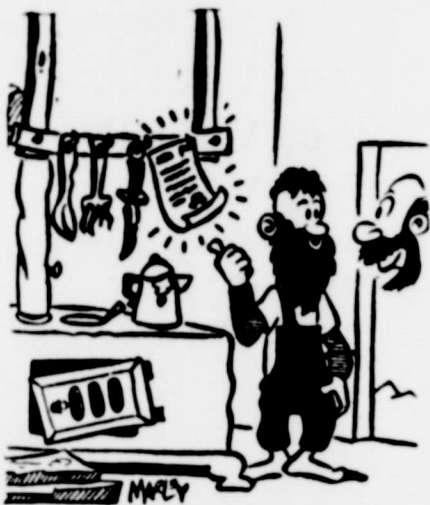
MAW'S GOT ALL OF HER SILVERWARE INSURED BY THIS POLICY WITH