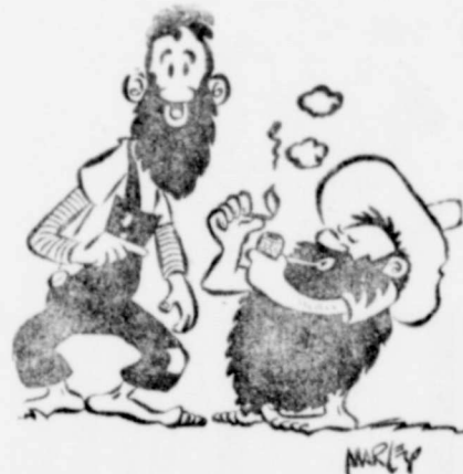
LIGHTN' HIS PIPE AINT NO HAZARD SINCE HE TOOK OUT A FIRE POLICY ON HIS BEARD WITH

and the cooperation of the Upton County Commissioners Court, the Rankin Independent School District, the Little League Association and the City of Rankin.