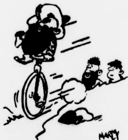
LIL' LONZO'S GON'TO TOWN TO GIT INSURANCE ON HIS BIKE WITH