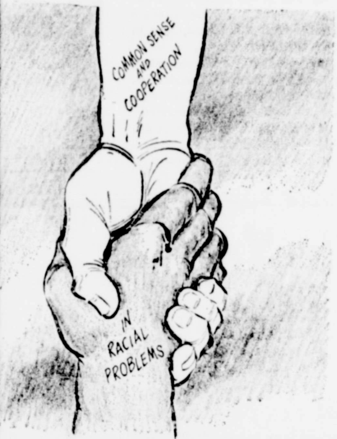
THE TEXAS WAY

Her hobbies include writing of poetry and short stories, paint- ing, sewing and horseback riding.