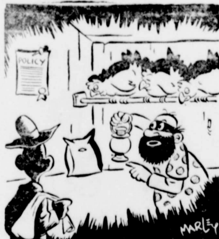
WE CAN'T STEAL TH' MECOY'S CHICKENS THEY HAVE A POLICY WITH