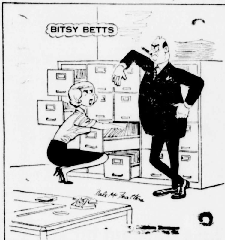
"Well, sometimes I just put things where there's room!"