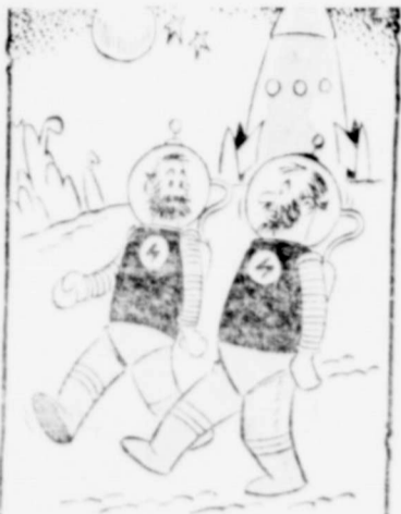
YOU WOULD FORGET THE RAZOR, NOW THEY'LL THINK WE CAME FROM CUBA!

Action at the club this weekend will feature the Junior Low Ball Partnership which is to be held Saturday, May 4.