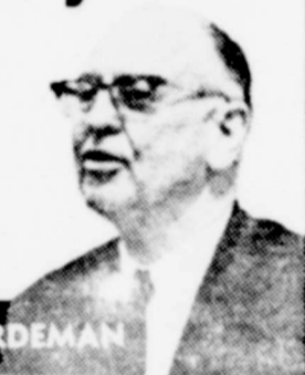
STATE SENATOR DORSEY HARDEMAN

He stands up for you... stand up for HARDEMAN election day