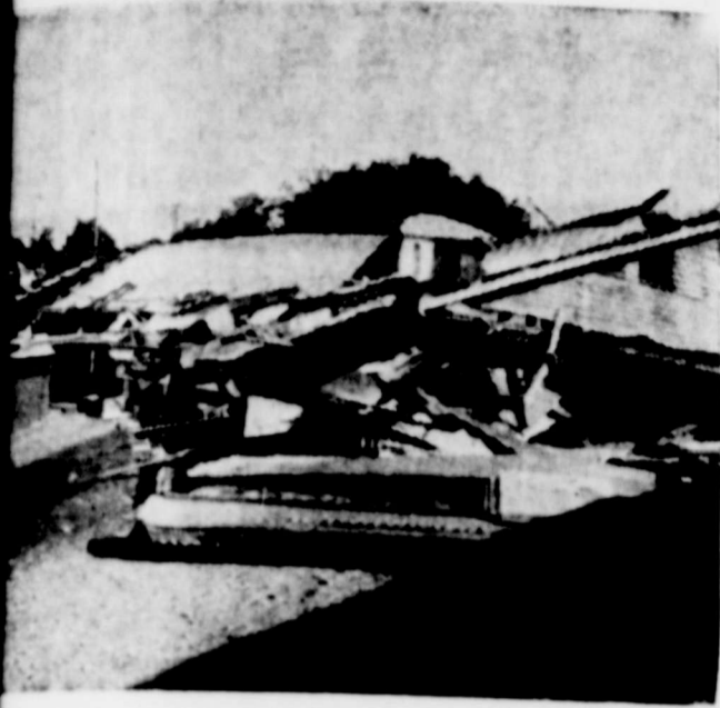
AS THE H. WHEELER Company Building as on June 2 following the storm that raked A total loss, the old sheet iron building has replaced with a new, modern steel structure.