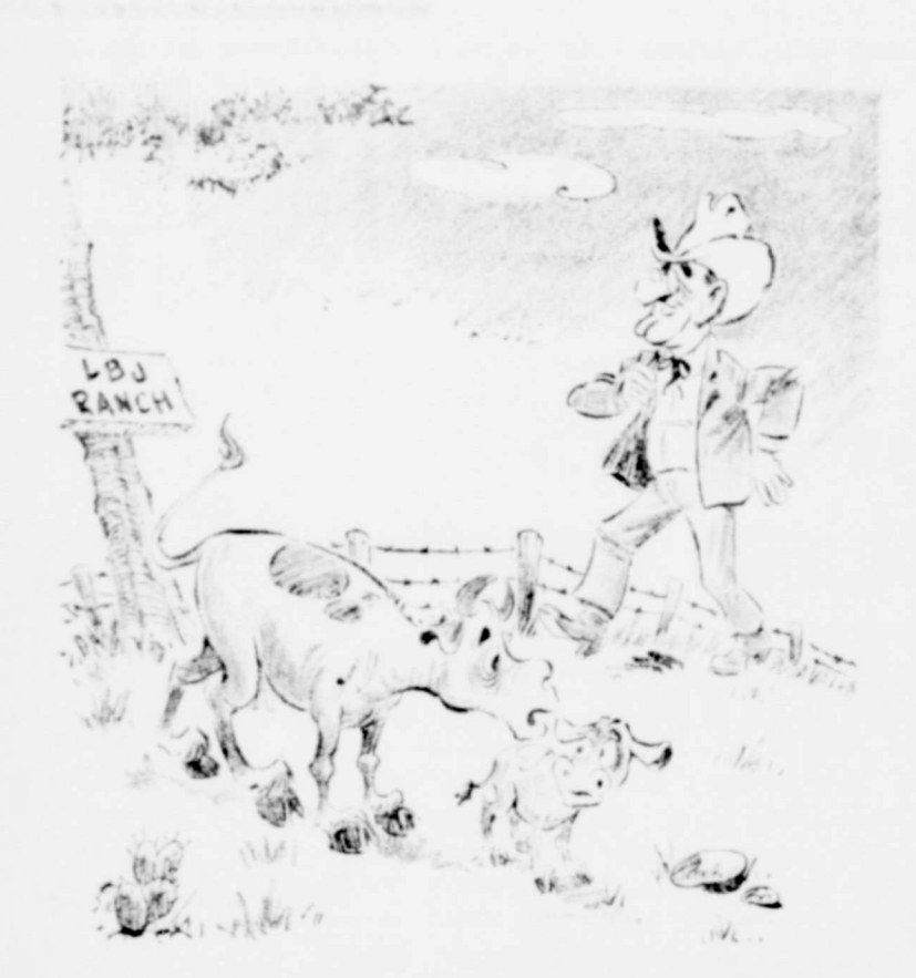
" NOW DON'T LET HIM REAINWASH YOU"

Of course we had one "show. (Continued to Next Page)