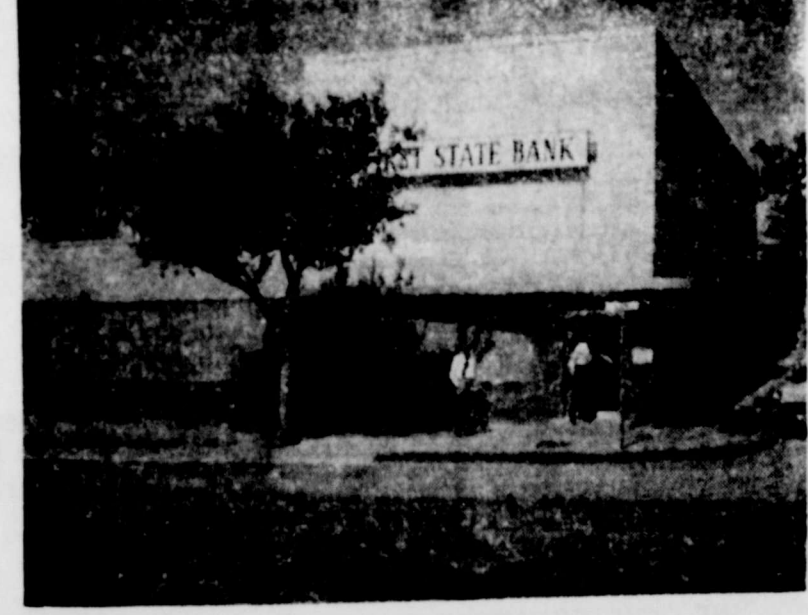
"We almost lost the whole thing . . ."