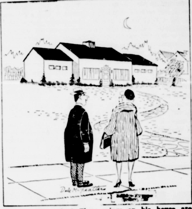
"Is he a stereo fan? Those wings on his speakers!"