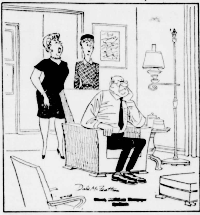
"He's feeling a little low. He was sure the firm would fold after he retired."