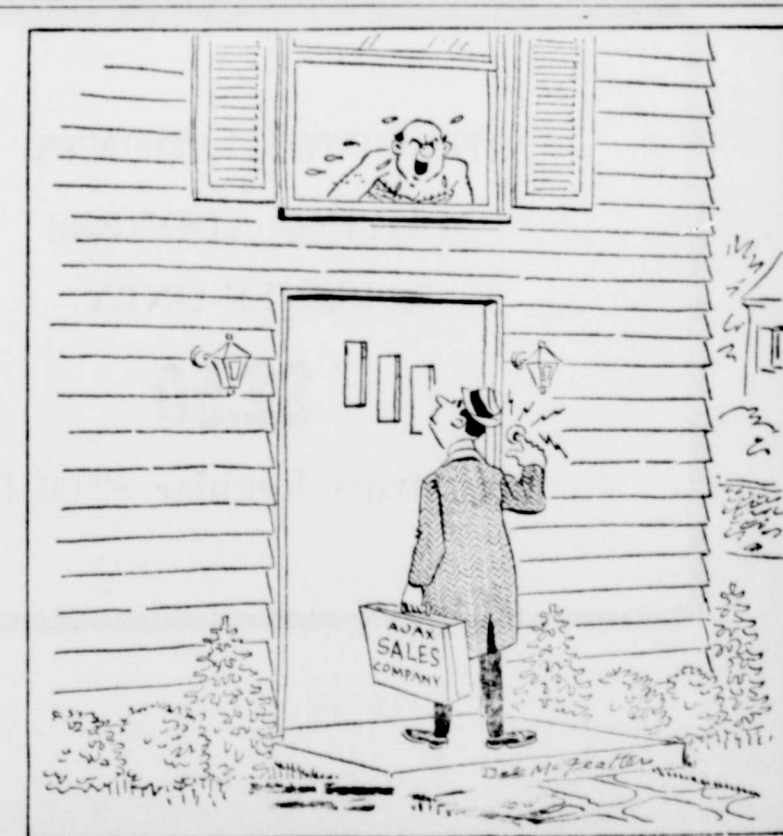
"It's a good thing these aren't medieval times, or I'd be pouring boiling oil on you!"

Cantaloupe, Roast Beef, Brown Gravy, Creamed Potatoes, English Peas, Orange Juice, Hot Rolls, Vanilla Pudding Fresh Milk and Butter served with each meal.