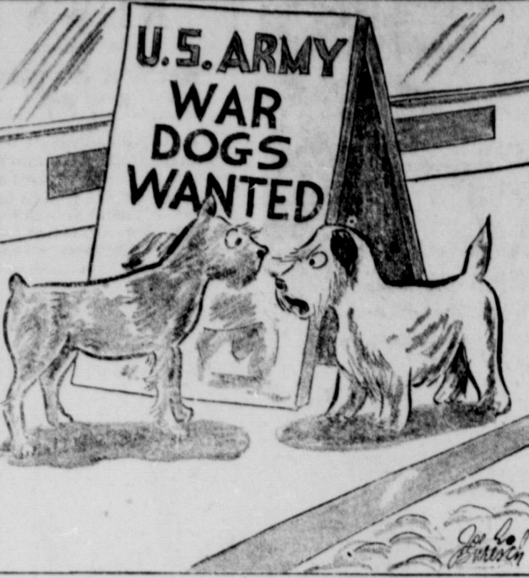
"I didn't make it either. They said I was too much bark and not enough bite."