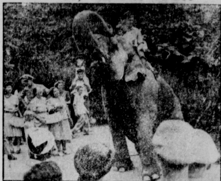
After a serious illness, Miss Jim returns to the scene of her triumpns in the St. Louis Zoo-taking children for a ride on her ponderous shoulders. Only a few at a time for a while, however. Doctor's orders.