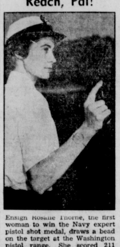
pistol range. She scored 211 out of 240.

From what I read in the pa- man, the things that God has again, as usual. ers and the magazines, and in store for him."-or words