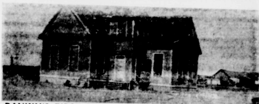
RANKIN'S FIRST CHURCH was located south of the present Elementary School and was called the "Community Church" since it was used by all denominations.

WE SALUTE THE OIL INDUSTRY THAT BRINGS PROGRESS TO RANKIN, UPTON COUNTY AND ALL THE PERMIAN BASIN