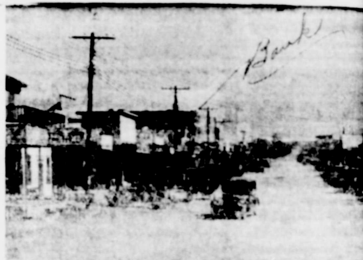
The Rankin (Tex.) News— Thursday, April 27, 1967