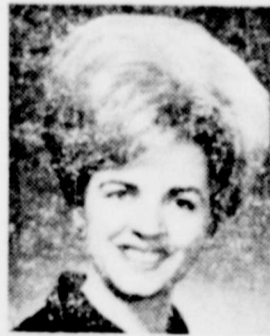
E Dorothy Parker