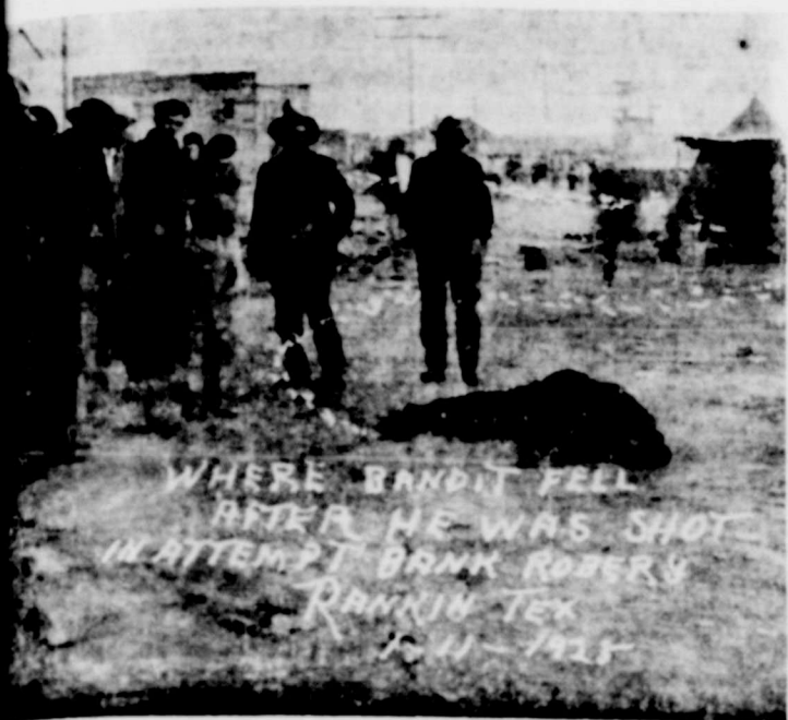
WAS not harmony in the early days of the Upton Oil Patch as attested by this photo taken January 28 and showing one of two bank robbers killed following an attempt to rob the First State Bank, then located at present B & L Money Mart. Robber lies dead near City Hall.

The Rankin (Tex.) News— Thursday, April 27, 1967