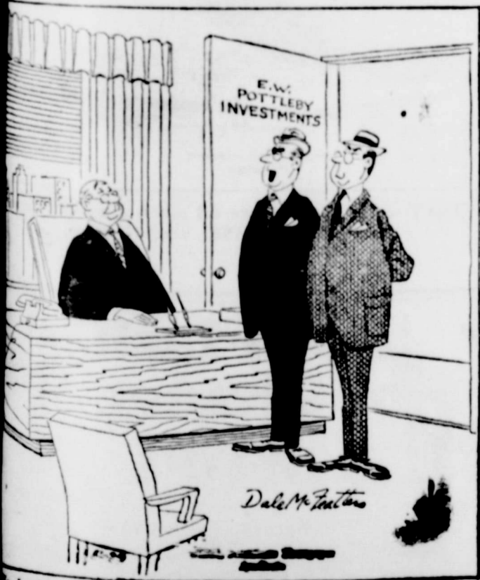
looked you up in Dun & Bradstreet, Pottleby. It said 'no comment!'"