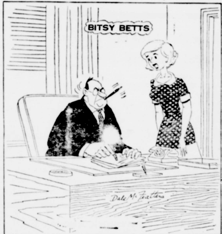
"Well, if you're not upset, why are you smoking your pen and signing letters with your cigar?"