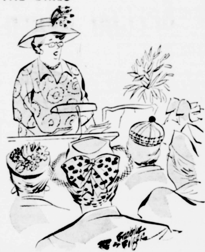
"May I request that, in the future, when our new recording secretary reads the minutes, she be a little more explicit than 'we yackety-yakked for an hour.'"