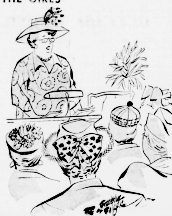
"May I request that, in the future, when our new recording secretary reads the minutes, she be a little more explicit than 'we yackety-yakked for an hour.'"