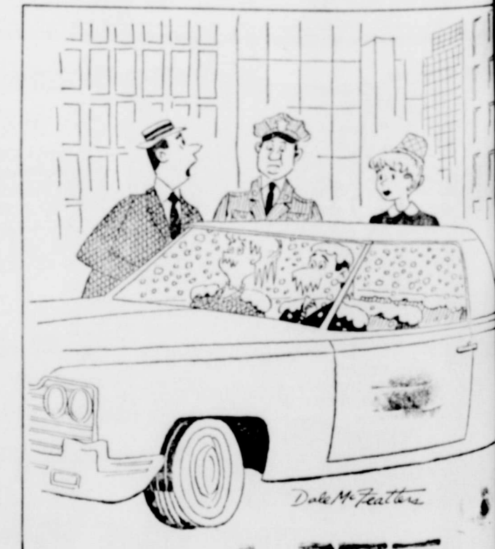
"I think something went wrong with their air conditioning!"