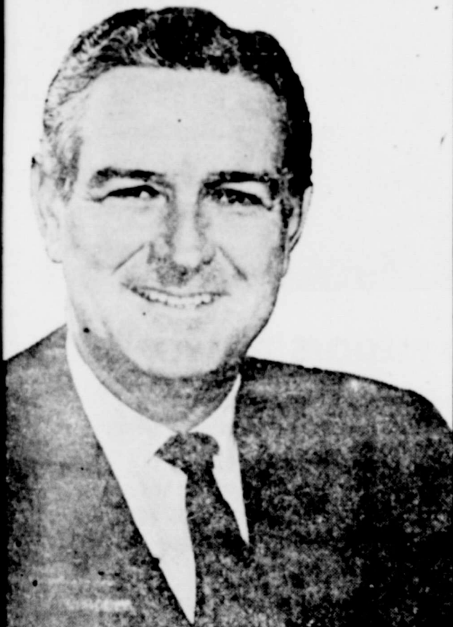
SEE GOVERNOR CONNALLY ON TV THURSDAY NIGHT, MAY 5

I am deeply grateful for your continued confidence. I hope that I may merit your support again on May 7th-- at the polls and at your next convention, to continue important progress we are making together.