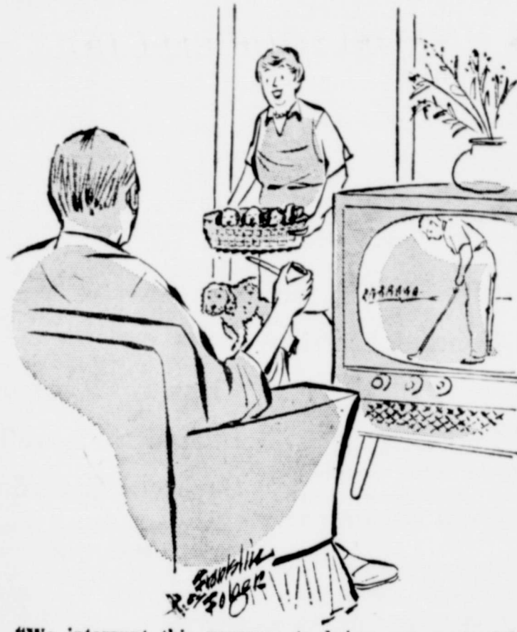
"We interrupt this program to bring you a special news bulletin!"